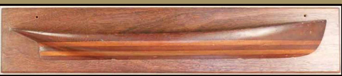
163 - YACHT "COMMODORE" 38" LONG X 7" TALL

BOSTONHARBORAUCTIONS.COM • INFO@BOSTONHARBORAUCTIONS.COM • 617.451.2650