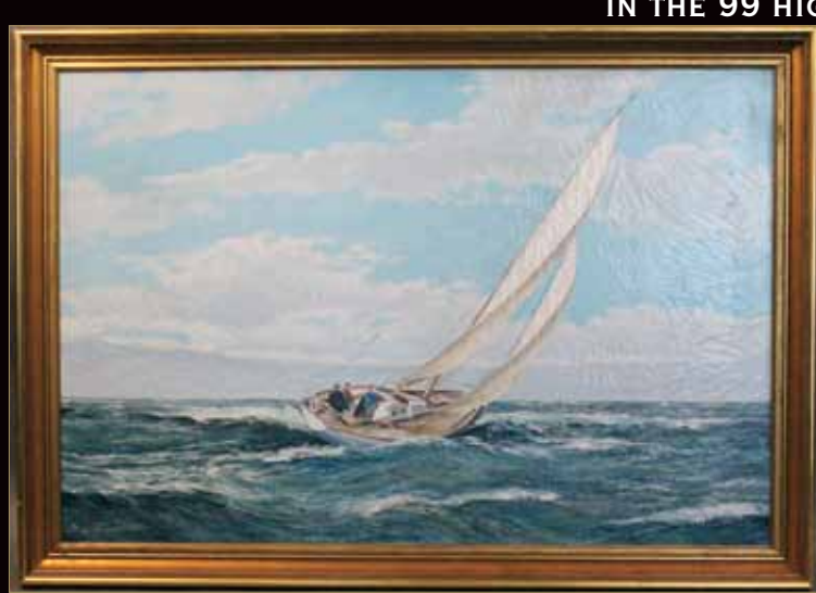
146 - MG FRIEDRICH YACHT PAINTING, OVERALL 28" X 39"