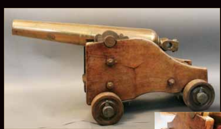
166 - 32" BARREL J. GREGORY SIGNAL CANNON