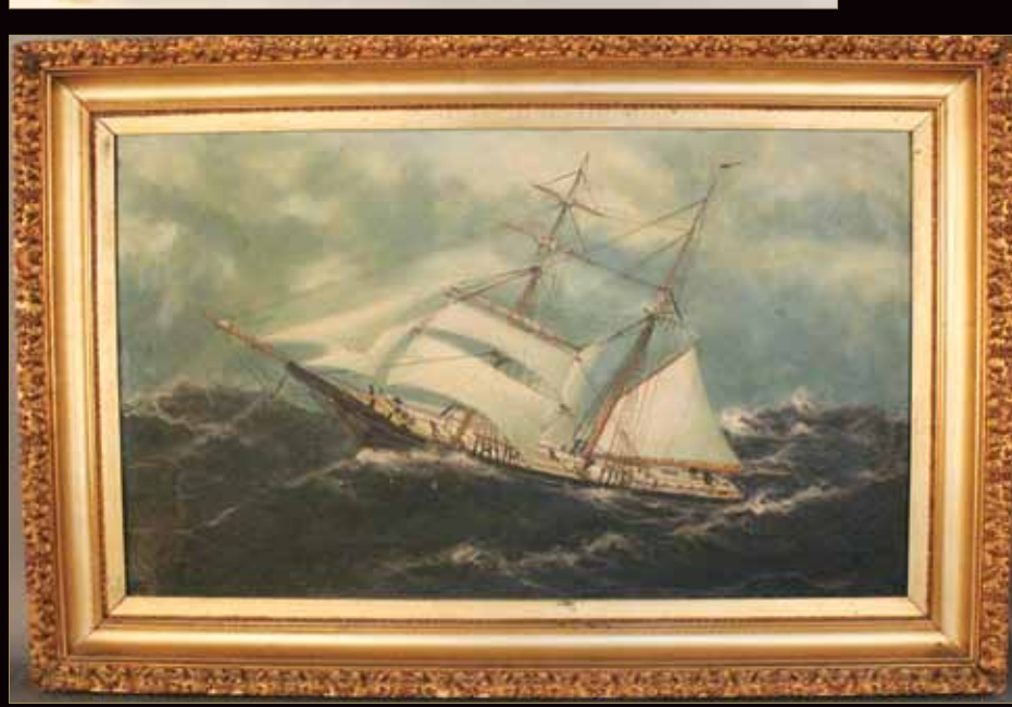
138 - BRIG "MARY", ATTR. TO WM STUBBS. 27" HIGH X 42" LONG, OVERALL. *