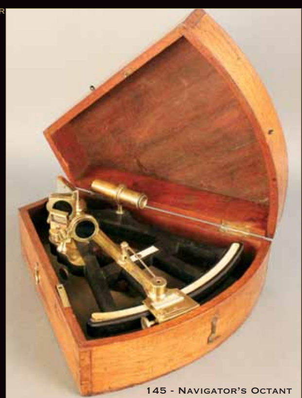
145 - NAVIGATOR'S OCTANT