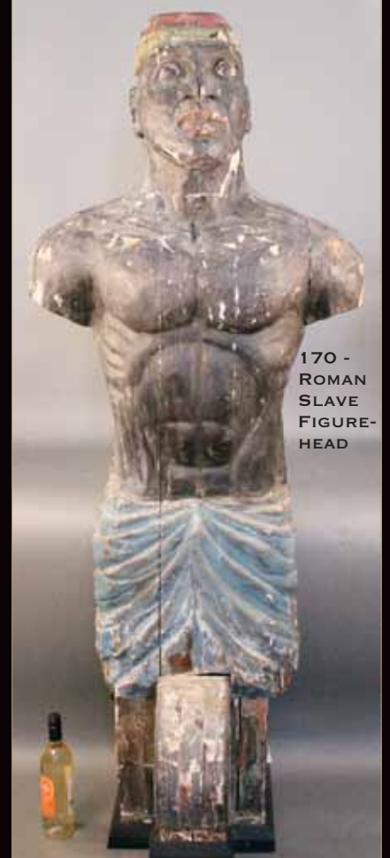
170 - ROMAN SLAVE FIGURE-HEAD

BOSTONHARBORAUCTIONS.COM • INFO@BOSTONHARBORAUCTIONS.COM PHONE, ABSENTEE & ONLINE BIDDING ACCEPTED • 617.451.2650 • ONLINE CATALOG AND DESCRIPTIONS AVAILABLE