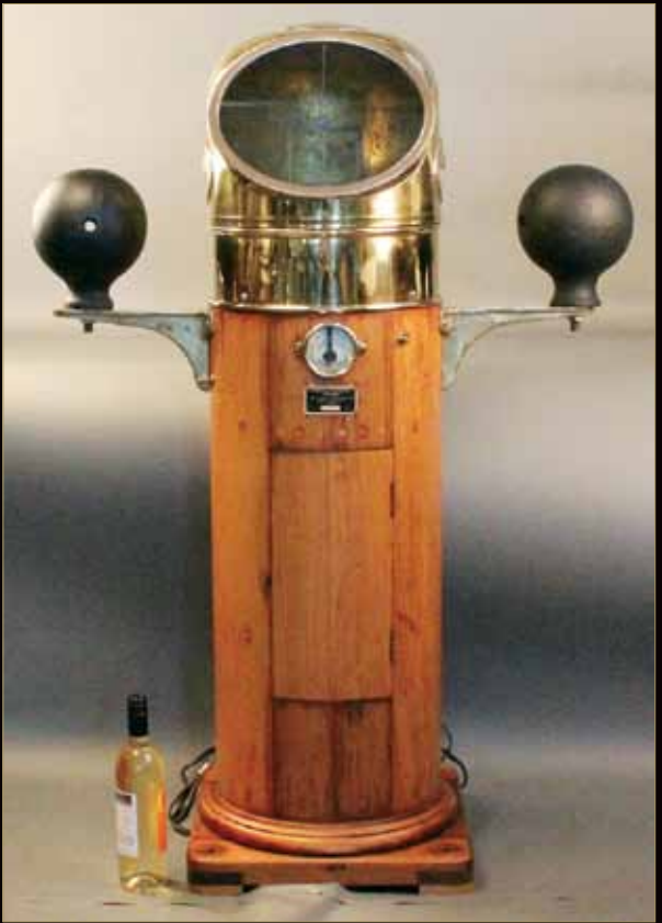
149 - AMERICAN BINNACLE, 52" TALL