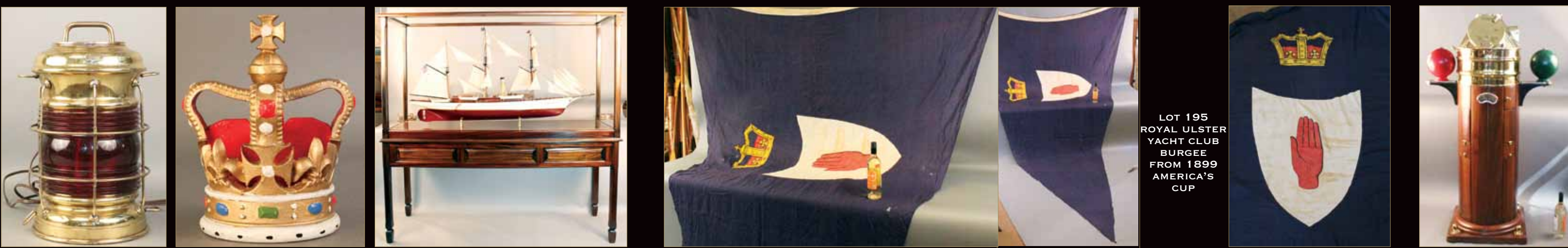
LOT 195 ROYAL ULSTER YACHT CLUB BURGEE FROM 1899 AMERICA'S CUP