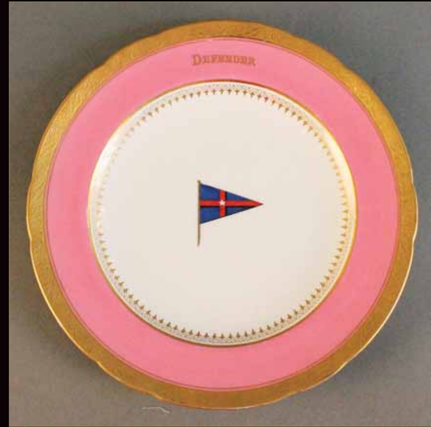
169 - AMERICA'S CUP PLATE "DEFENDER"