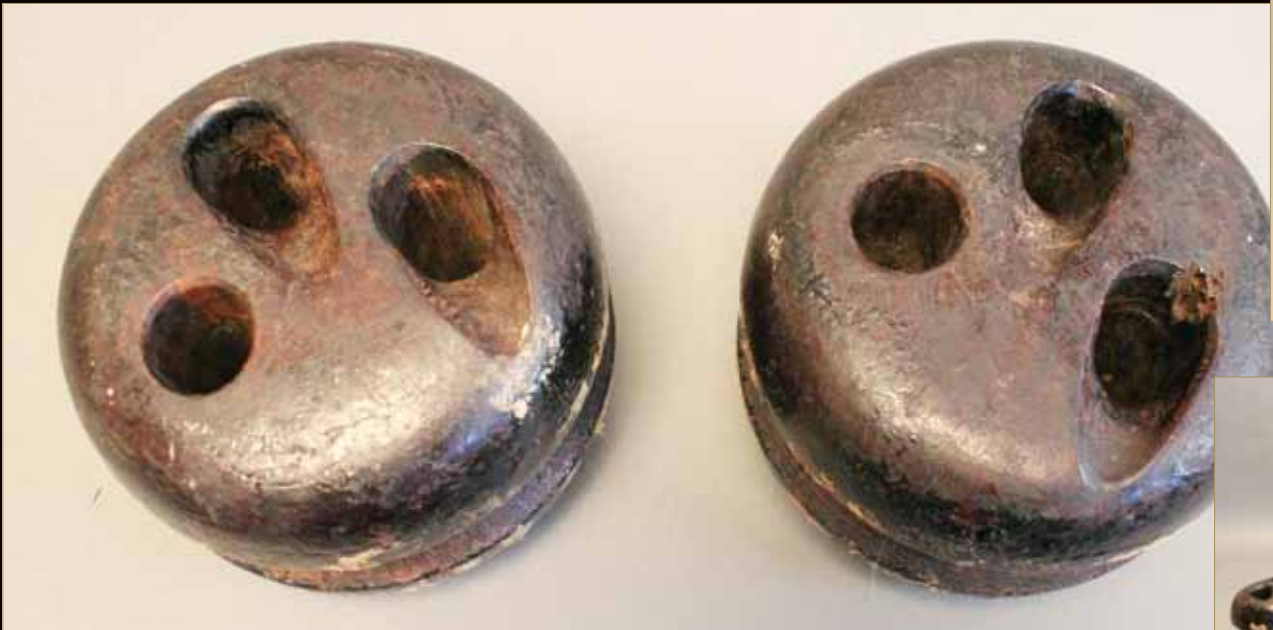
165 - "DEADEYES" FROM 1851 CUP YACHT "AMERICA"